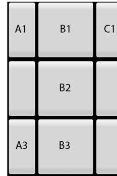
FIGURE 2. The button layout on the touch screen. B1, B2 and B3 are used to select the scanning distance, A1 selects guiding mode, C1 scanning mode, and A3 the POI to be guided to.

noticeable if POIs are very close in angle and falling into the same sector range (see points A and B in figure 1), and disturb the user experience. We do, as yet, not employ any signal filtering strategy, and although we want to minimize processor usage, some filtering strategy might need to be adopted in a later stage.